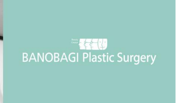
Doctors gown with BANOBAGI symbol on it