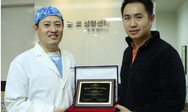
Certificate & Photographs